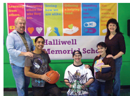
Members of the Kaleidoscope Theatre

For more information on the SORT Program, call 401-723-6753.