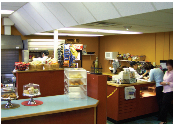
West Wing Café

The foundation granted a request to fund improvements for the Café. With this support, the café's expansion will offer employment to people with disabilities on a larger scale, improve profitability and enhance the organizations self-sufficiency.